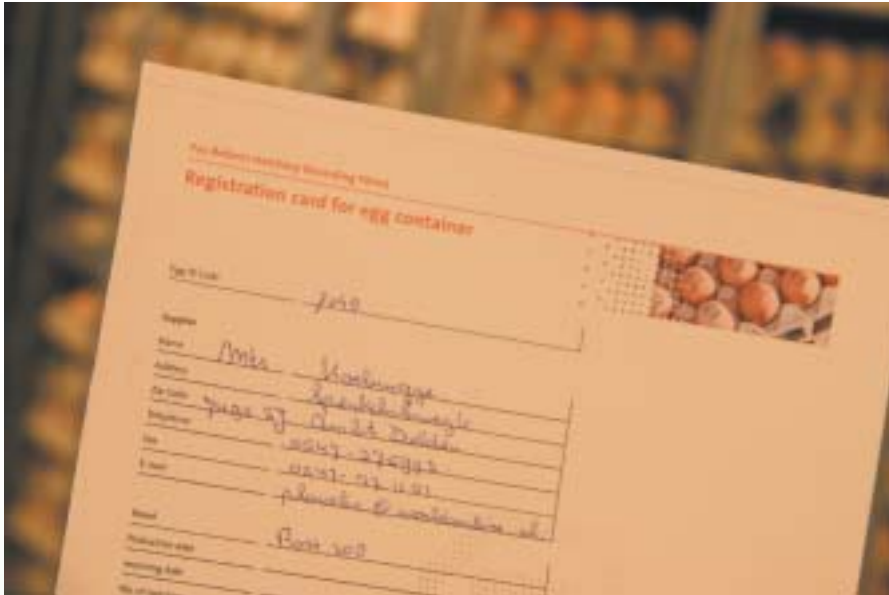
Records are the backbone of traceability.

Continued from page 27 affects hatchability and chick quality, it is inevitable in modern hatchery practice.