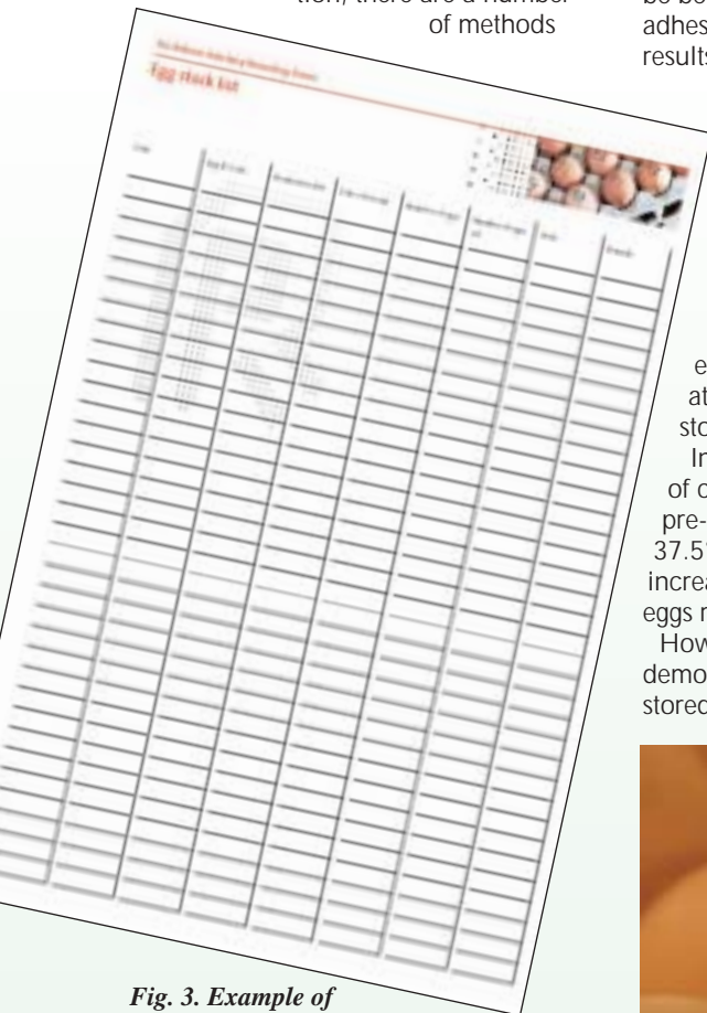
Fig. 3. Example of a planning form.

first and second week of incubation on the hatchability of stored eggs. The effects of incubation temperature treatments in broiler eggs are currently being studied at the R&D department of Pas Reform. The measures previously mentioned offer fairly easy tools to reduce losses in hatchability and chick quality after pre-incubation storage. In addition, there are a number of methods